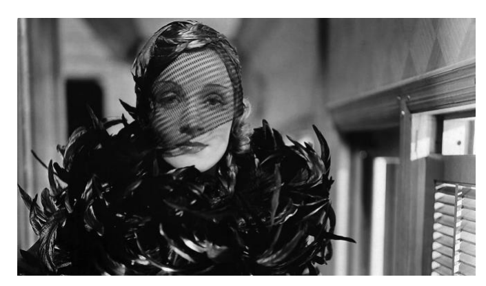
Shanghai Express PG

German filmmaker F.W. Murnau was one of the leading figures in the early years of European cinema. Between 1919 and 1926, he made 18 film which established him as a leading figure of German Expressionism and technological pioneer in Germany's UFA studio The most well-known today is probably Nosferatu: A Symphony of Horror which established a striking visual aesthetic for horror films in general and vampire films in particular. With many of his early films lost, the true scale of Murnau's achievement is difficult to fully articulate but there is no doubt that Hollywood was watching the success of this European filmmaker. In 1926, William Fox, the Hungarian born owner of the young Fox Studio, invited Murnau to Hollywood. The first result was Sunrise: A Song of Two Humans which is now widely recognised as a one of the pinnacles of new art form and revolutionised the way American filmmaking would be approached. Made in the twilight of the silent era Sunrise is a milestone of film expressionism and one of the few films to instantly achieve legendary status.