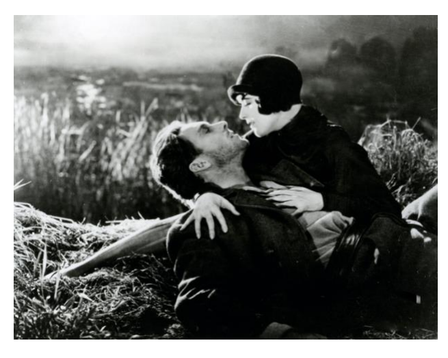
Sunrise: A Song of Two Humans U