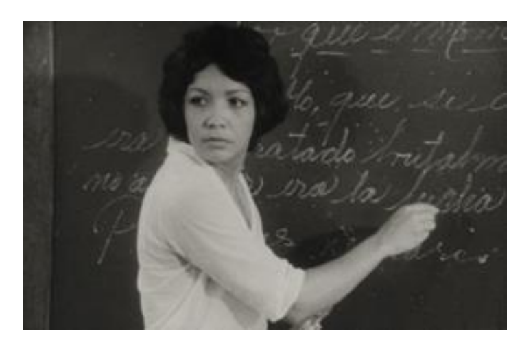
De Cierta Manera 15

Format: DCP File download Terms: £135 (+ £45 Download costs) / 35% Net Box office split